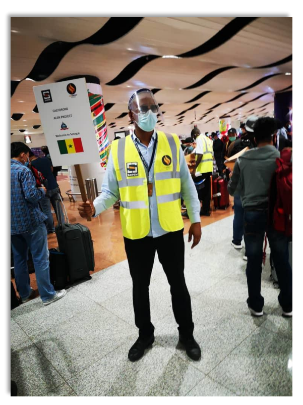
Supermaritime Husbandry / Meet & Greet Services at Dakar Blaise Diagne int. airport