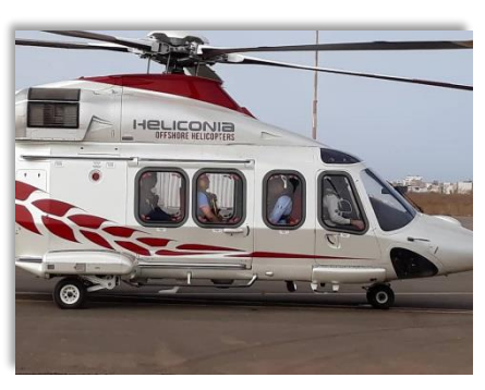
Supermaritime Husbandry Services / meet & greet at Dakar Heliport