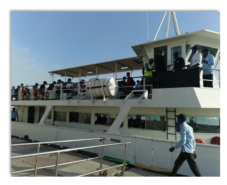
Supermaritime transportservice to vessels operating offshore in Senegal